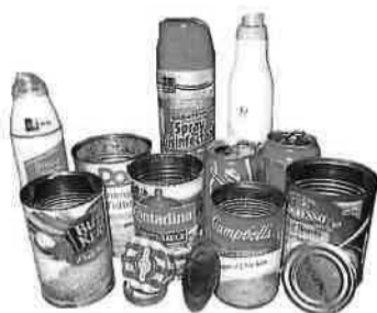
Aluminum, Tin and Empty Aerosol Cans