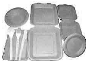
Compostable Plates, Containers, Cups, Utensils and Bags