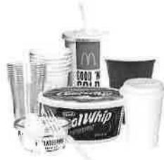
Plastic and Paper Cups, Tubs, Lids and Utensils