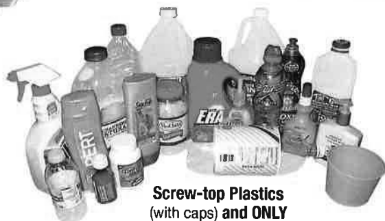
Screw-top Plastics (with caps) and ONLY Yogurt and Margarine Tubs (NO LIDS)