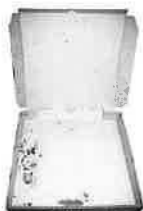
Food Contaminated Items (pizza boxes, paper plates, napkins, etc.)