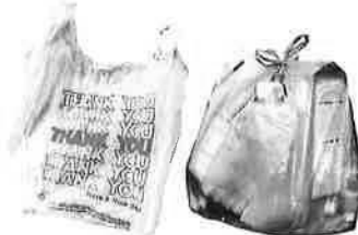
Plastic Bags or Recyclables in Plastic Bags