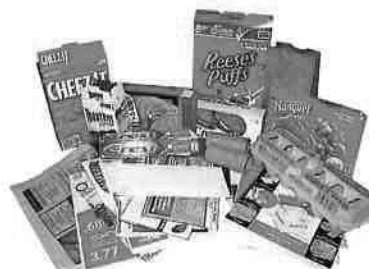
Newspaper, Glossy Inserts and Magazines, Mixed Paper (junk mail, phone books, envelopes) Cardboard (break down flat to fit inside or beside cart)