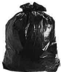
Garbage or Yard Debris