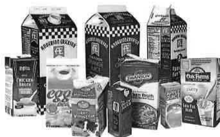
Paper Food Cartons (no caps) (not cylinder shaped)