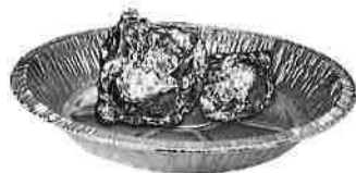
Baking Tins and Aluminum Foil