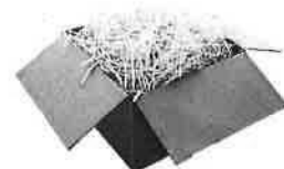
Shredded Paper (place in box or paper sack)