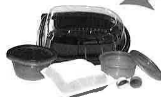
Plastic and Styrofoam Food Containers, Lids and Loose Caps