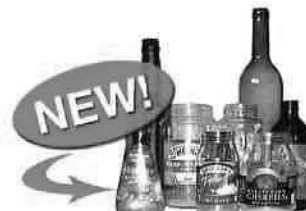
Glass Jars & Bottles